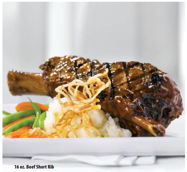
16 oz. Beef Short Rib

Rotisserie chicken, sun-dried tomatoes and baby spinach tossed in a house rosemary cream sauce with grated Parmesan cheese. 15.5 with corn pasta.