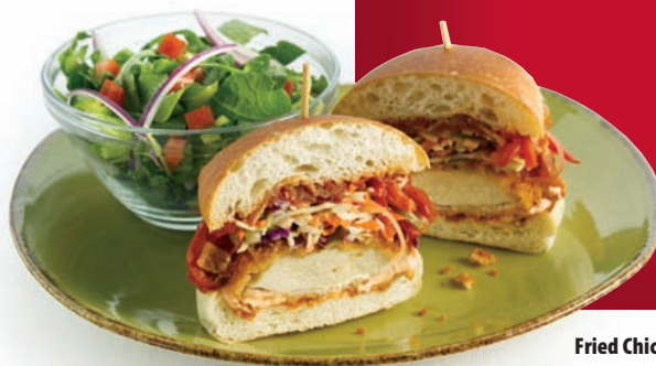
Fried Chicken Sandwich

Veggie patty, grilled red peppers, zucchini, tomato, red onion and lettuce. 13.5