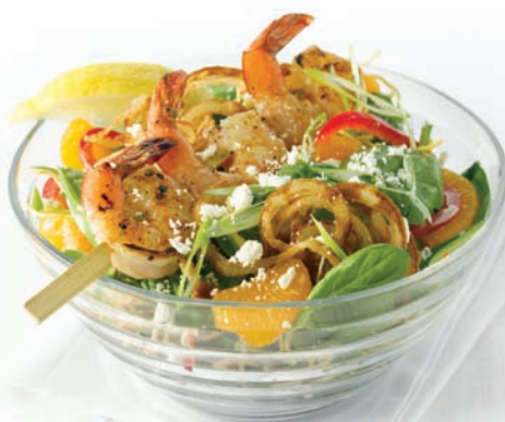
Spinach Salad with a Grilled Shrimp Skewer