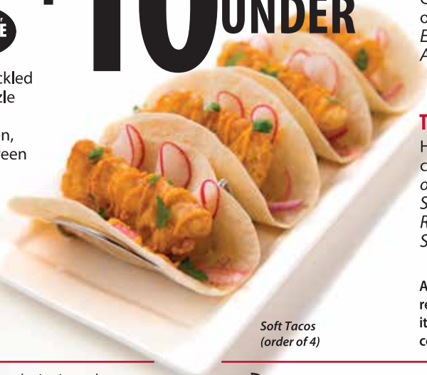
Soft Tacos (order of 4)