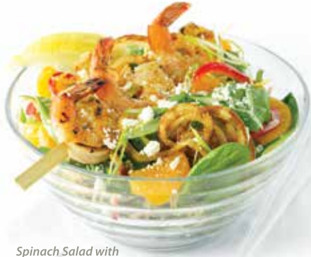
Spinach Salad with Grilled Shrimp

Skewer of grilled shrimp, baby spinach, Mandarin oranges, red peppers, green onions, egg, bacon bits, crisp onion strings, Lo Mein noodles and feta cheese tossed in our house orange poppy seed dressing 18